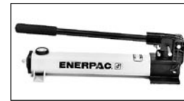
Fig. S69 — Hand Pump