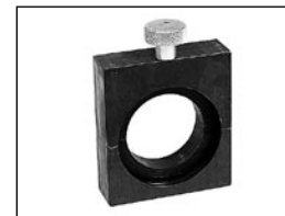
Fig. S72 — Die Retainer