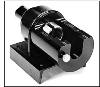
Fig. S67 — Hydra-Tool