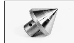
Fig. S70 — Flaring Cone