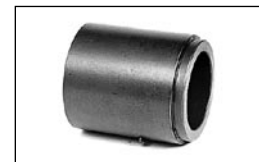
Fig. S71 — Die Ring