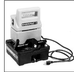
Fig. S68 — Electric Pump